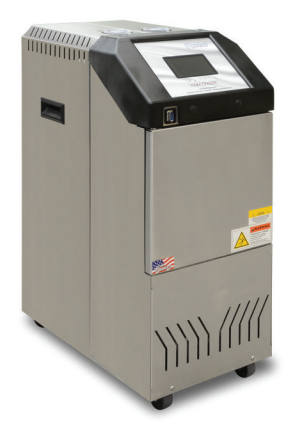
Cabinet style for units with • 16 kW & smaller heaters • • 3 hp & smaller pumps • Approximate dimensions

Approximate dimensions 29½" x 12½" x 19" _{(\text{HxWxD})}