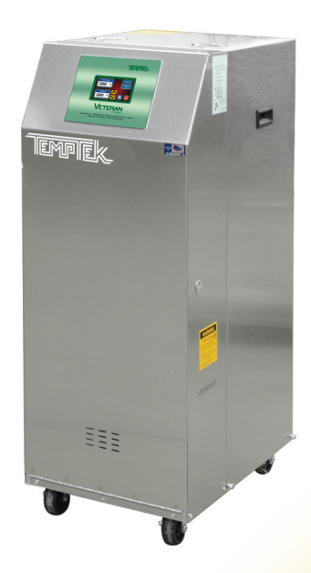
Cabinet style for units with • 24 & 34 kW heaters • • Up to 3 hp pumps • Approximate dimensions 44" x 16" x 24" (HxWxD)