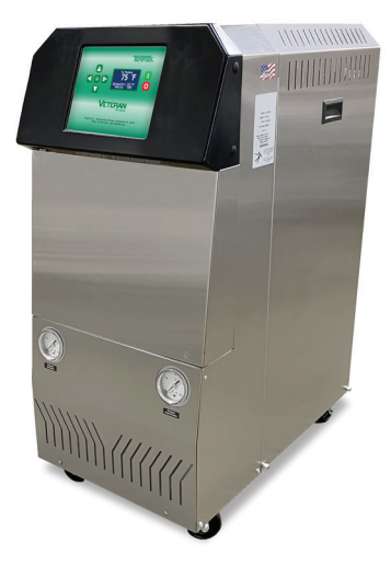
Cabinet style for units with • 5 & 7½ hp pumps • Approximate dimensions 40" x 18" x 29" (HxWxD)

Approximate dimensions 29½" x 12½" x 19" _{(\text{HxWxD})}