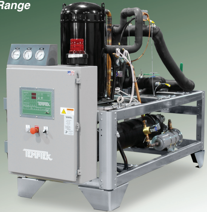
Typical MW chilling module

The MW Series chiller module is designed for indoor installation and requires a condensing water source. Chilling modules are offered in single, dual and triple zone configurations.