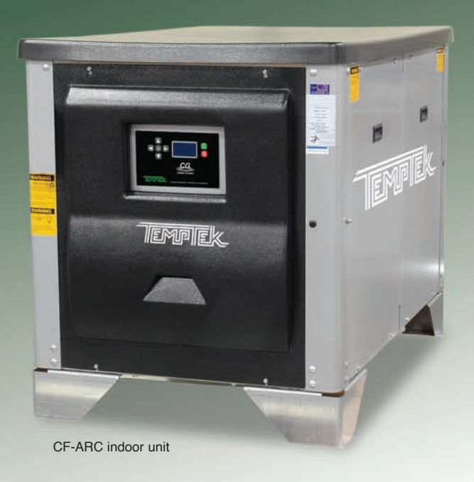
CG Control Instrument