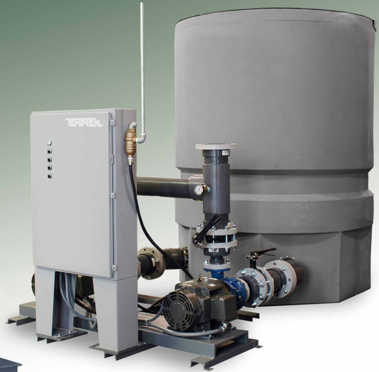
PPT-1500-2P shown with these optional features: • Central control console • Electric water make-up system