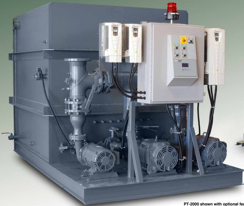
PT-2000 shown with optional features: • Standby pump and manifold • Central control console • Pressure and temperature alarm system • Electric water make-up system • Variable Speed Drives